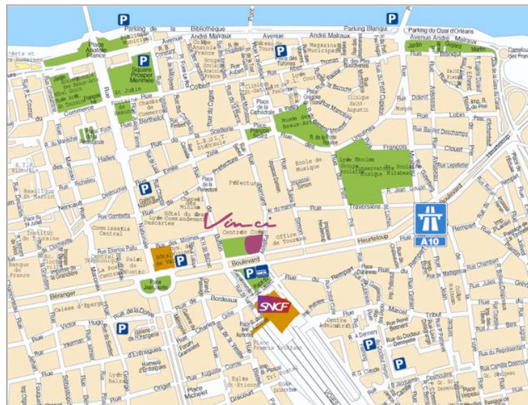
Map of Tours city center